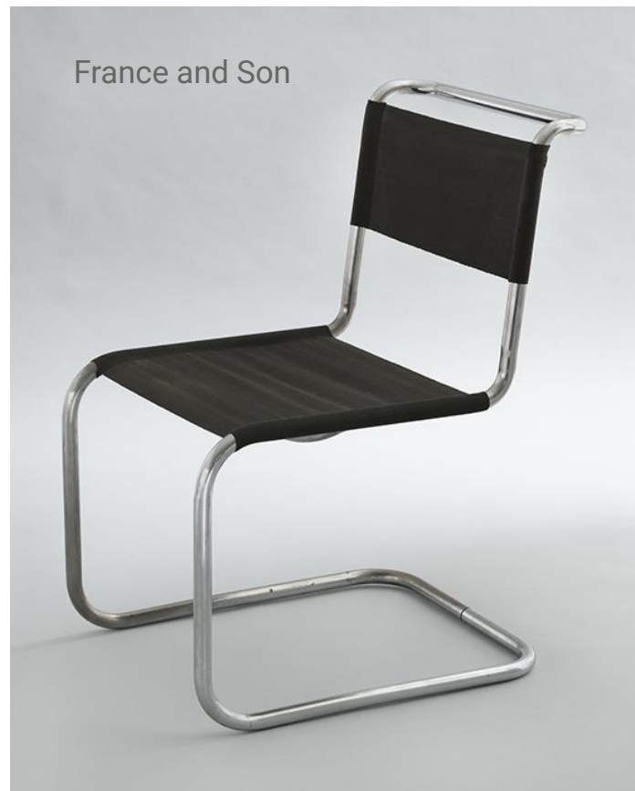
France and Son